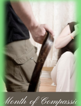
Month of Compass. Gender based violeni