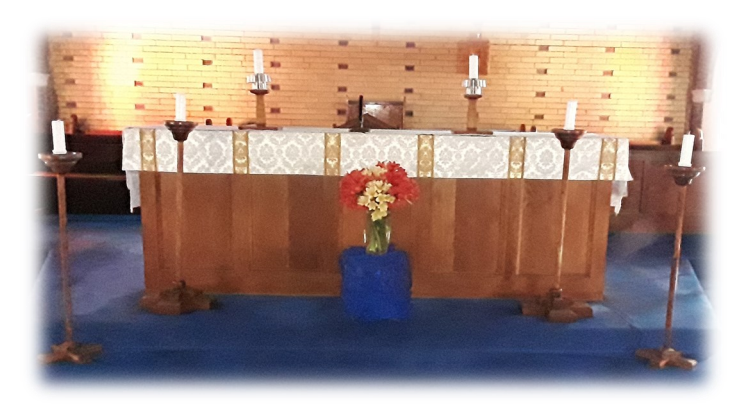
During the singing of the hymn - Jesus shall reign whereer the sun - the Altar will be incensed

The full service or the sermon can be viewed from the website.